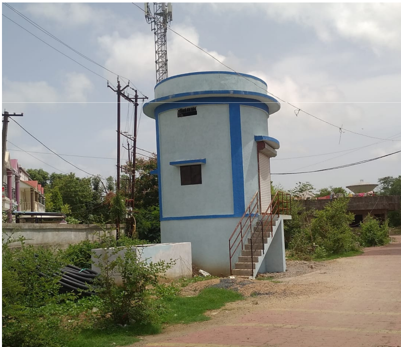
Sona Sarita Pumping Station